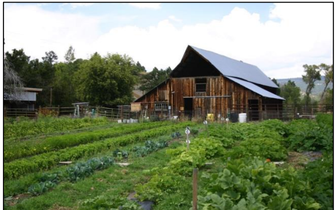
Healthy Growers, Eaters, & Future

Healthy Foodsheds → Healthy Food → Healthy People → Healthy Future